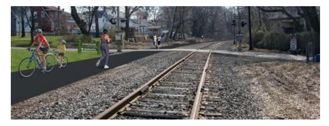
Artist rendering of what the proposed Greenway would look like.

NJ Transit closed the line to passenger traffic in 2002, following the opening of the Montclair Connection near Bay Street Station. The section of the line in Glen Ridge, Bloomfield and Kearny was sold to Virginia-based freight railroad Norfolk Southern.