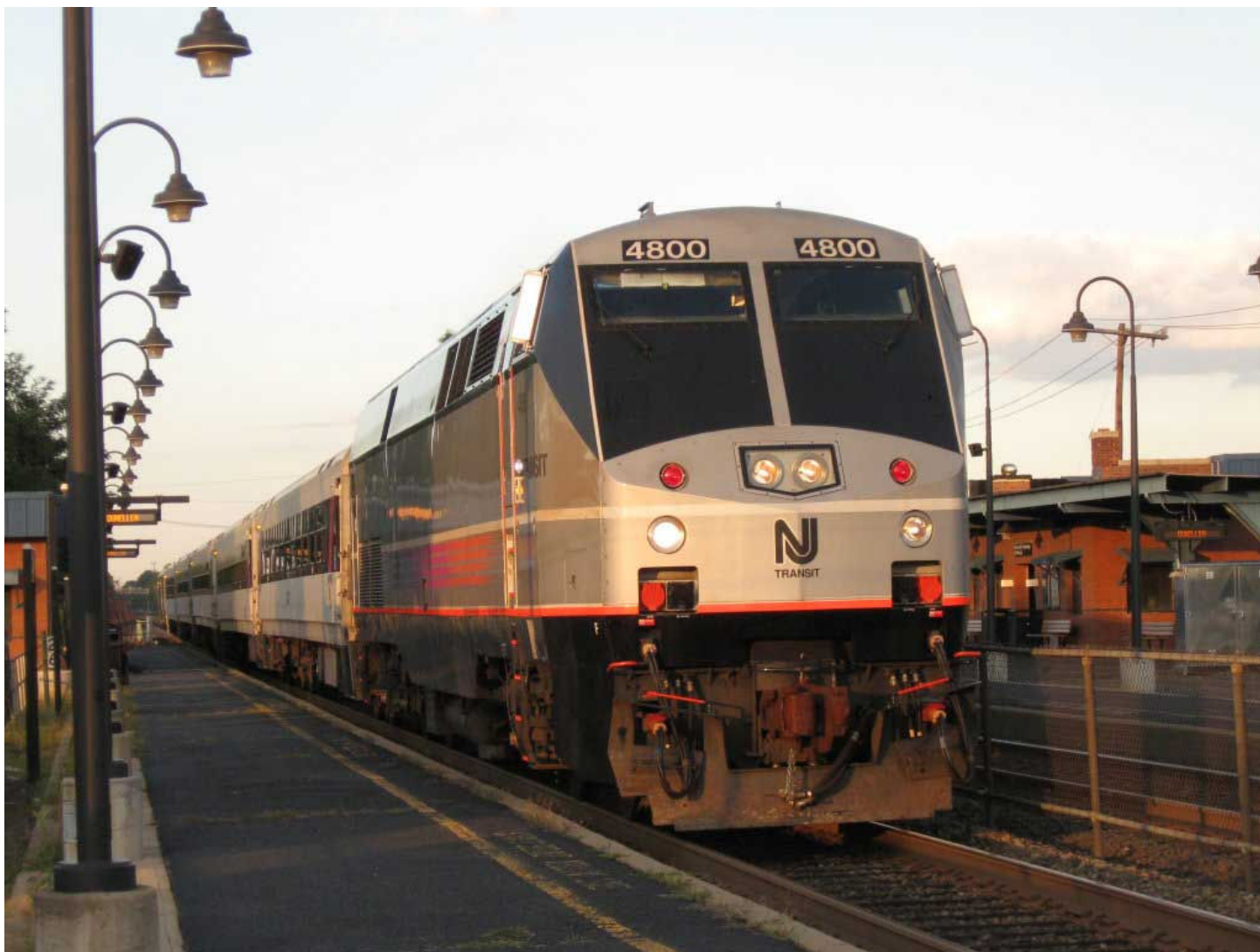
New Jersey Transit train.

New Jersey Transit (NJT) is looking into the possibility of bringing back transit service on two unutilized rail lines in Essex and Hudson counties but is releasing barely any information regarding its plans.