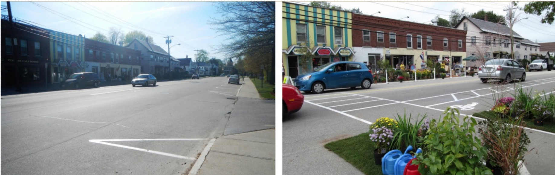
Before & after tactical urbanism event in Keene, NH