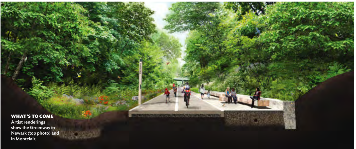
WHAT'S TO COME Artist renderings show the Greenway in Newark (top photo) and in Montclair.

urban area, people will have access to nature and recreational activities. And it will link communities in ways they are not already connected,” says Gill. “This no longer becomes a question of if, but when.”