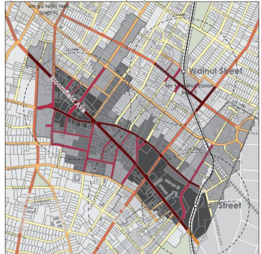
Detail of the Bloomfield Ave corridor and the Walnut St and Bay St station TOD areas.